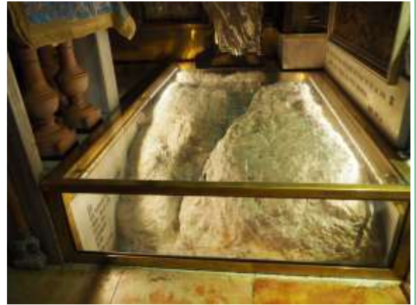
Stone of Unction

Ecce Homo where I stay and study is in the Old City of Jerusalem. Al Aqsa Mosque on the site of the Jewish Temple which was destroyed in 70 CE is almost reachable from the terrace of my room. Turn 30 degrees and I can see the Holy Sepulchre, the Empty Tomb and Calvary. This city which is important for all three Abrahamic Religions (Jews, Christians and Muslims) is always buzzing with pilgrims, vendors, and celebrations.